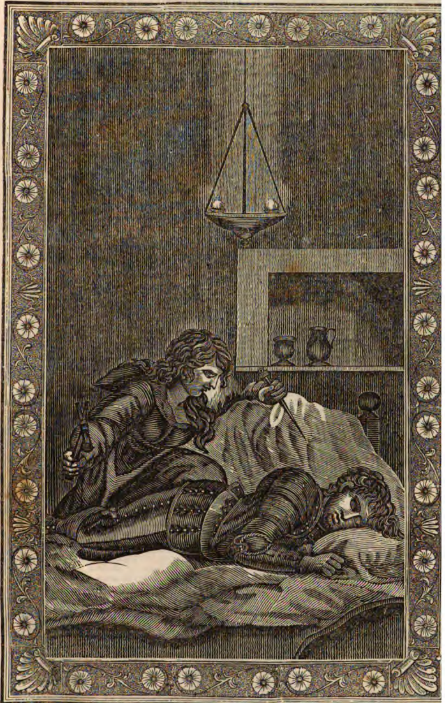
JAEI KILLING SISERA.